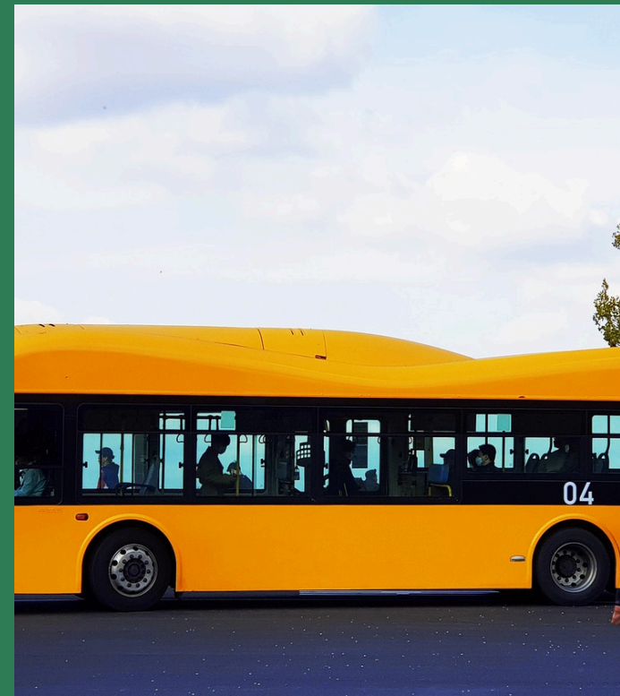
Sofia Bus Station

The main arrival point for participants is Sofia Airport (SOF), the largest international airport in Bulgaria. From Sofia, participants can travel to Veliko Tarnovo by bus or train, with a travel time of approximately 3–4 hours.