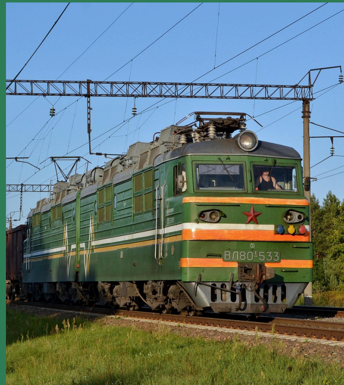
Sofia Train Station